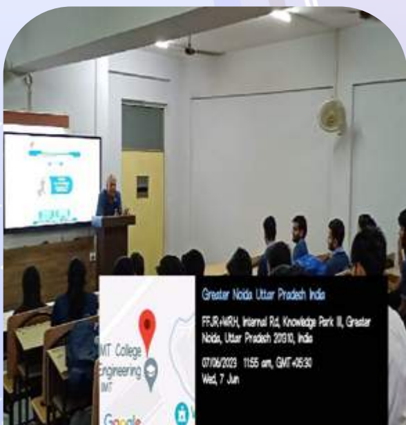
A workshop on “Prototype/Process Design and Development

The speaker discussed the demand of market or industry and how the students can find out the right opportunities in the market as an entrepreneur. The main objective of the event was to provide the students with exposure to entrepreneurship and career development by starting to think about a tiny problem.