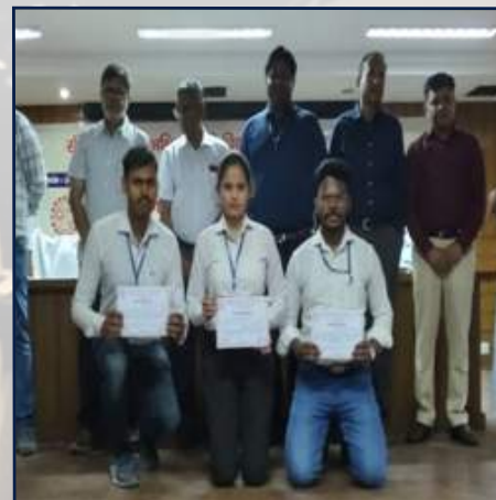
Project presentation at Lucknow under CST-UP2022-23